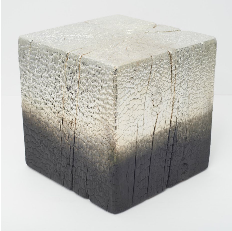
Miya Ando, January 5 2021 Matsu Pine Shou Sugi Ban Silver , 2021 Reclaimed charred pine, silver nitrate, 11 x 11 x 11 inches