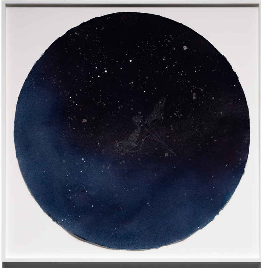
Miya Ando, Engessō Cygnus (Moon Ensō) The Swan Above The Yard Bolinas, CA, November 25, 2019, 8:32 PM, 2022, pure silver, natural indigo dye, Washi paper, 65 x 65 inches