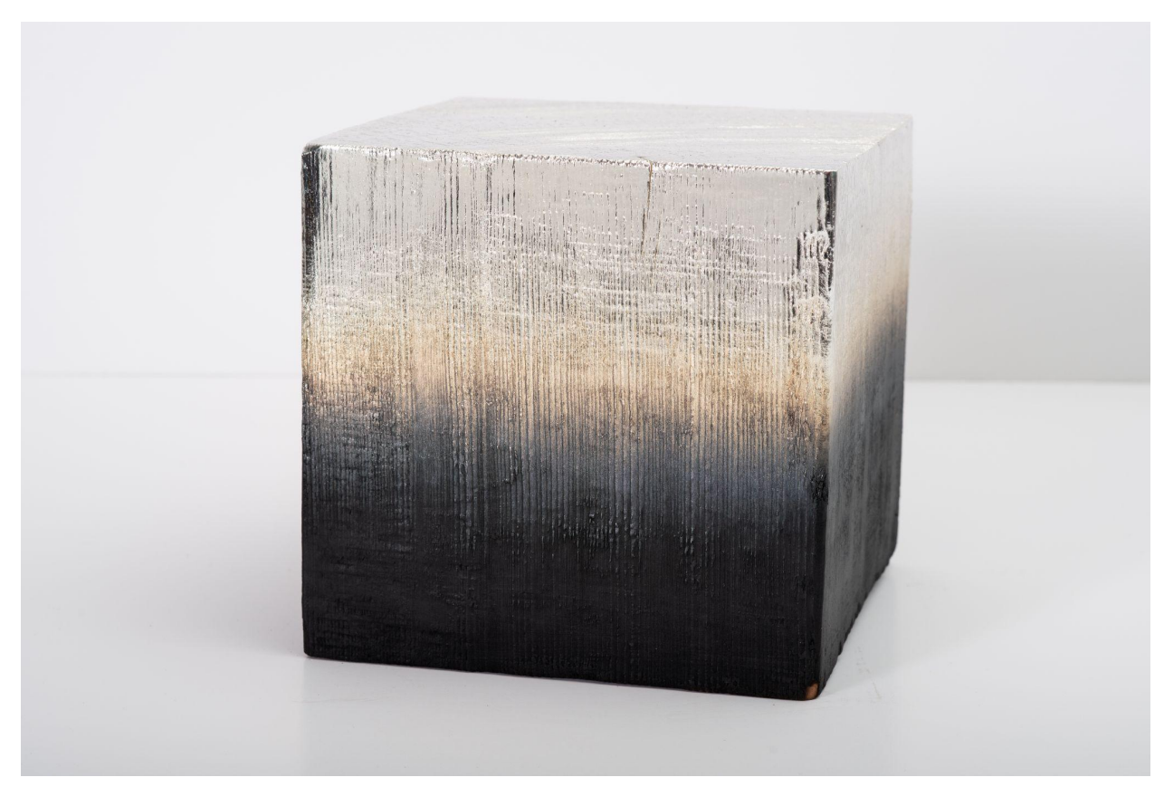
MIYA ANDO, Alchemy (Shou Sugi Ban) Cube 3.19.8.7, 2019, Charred Reclaimed Redwood, Silver Nitrate 8 x 8 x 8 inches, courtesy of the artist.