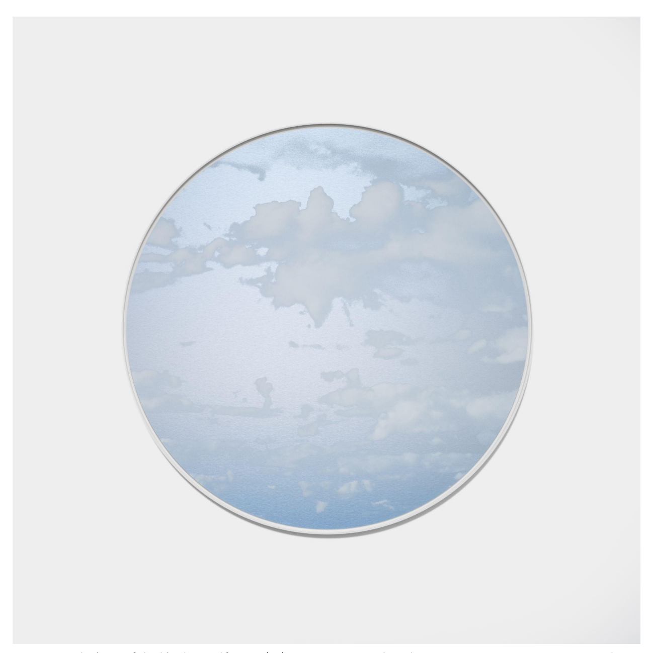
MIYA ANDO, Unkai (A Sea Of Clouds) Bolinas, California 12/30/2021 7:20 PM , 2022, Ink on Aluminum Composite, 45.75 x 45.75 x 0.125 inches, courtesy of the artist.