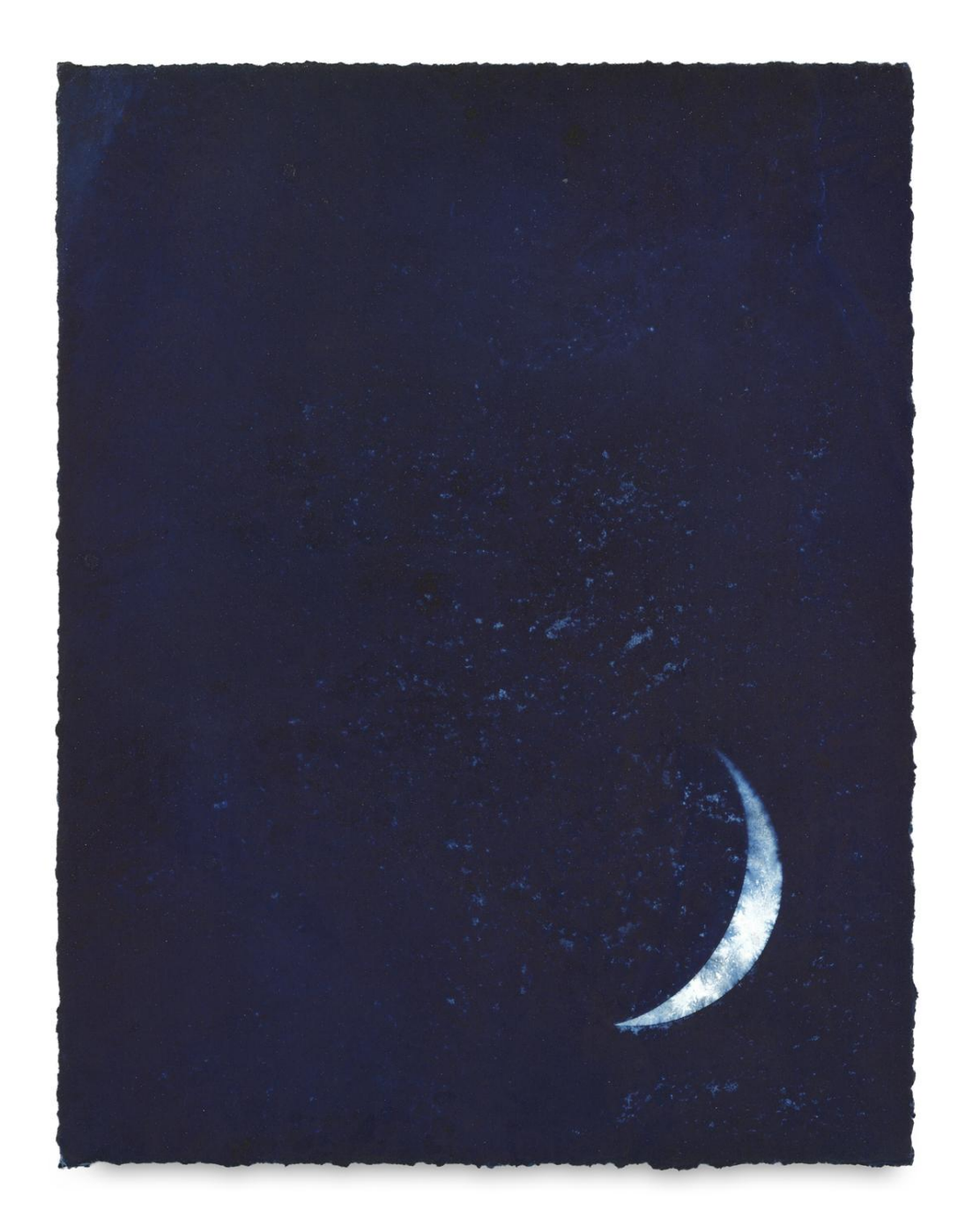
MIYA ANDO, 0702_Ugetsu (Rain Moon) Waxing Crescent July 14, 2021, Day 489 NYC, 2021, Natural Indigo, Micronized Pure Silver, Hahnemühle Paper, 11 x 8.5 inches, courtesy of the artist.